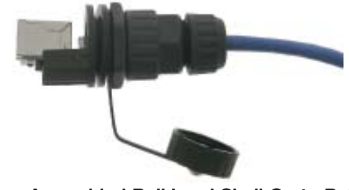
5: Screw Assembled Bulkhead Shell On to Bulkhead Body Until Seats Tighten the Compression Nut Allow clearance to loosen Attachment Nut

Information obtained from or supplied by Mpja.com or Marlin P. Jones and Associates inc. is supplied as a service to our customers and accuracy is not guaranteed nor is it definitive of any particular part or manufacturer. Use of information and suitability for any application is at users own discretion and user assumes all risk.